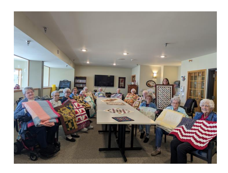
What a great group of talent.