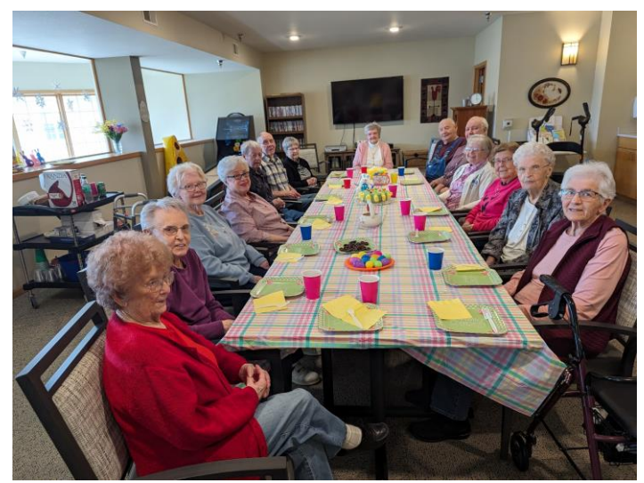
What better way to celebrate Easter than with friends. We all enjoyed some tasty drinks and snacks, along with some good memories of Easter.