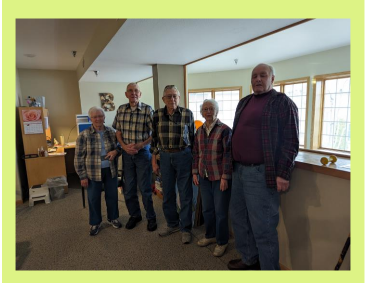
It was national wear plaid day and the residents stepped up to the plate and dug out all their plaid attire. Who knew there were so many plaid designs.