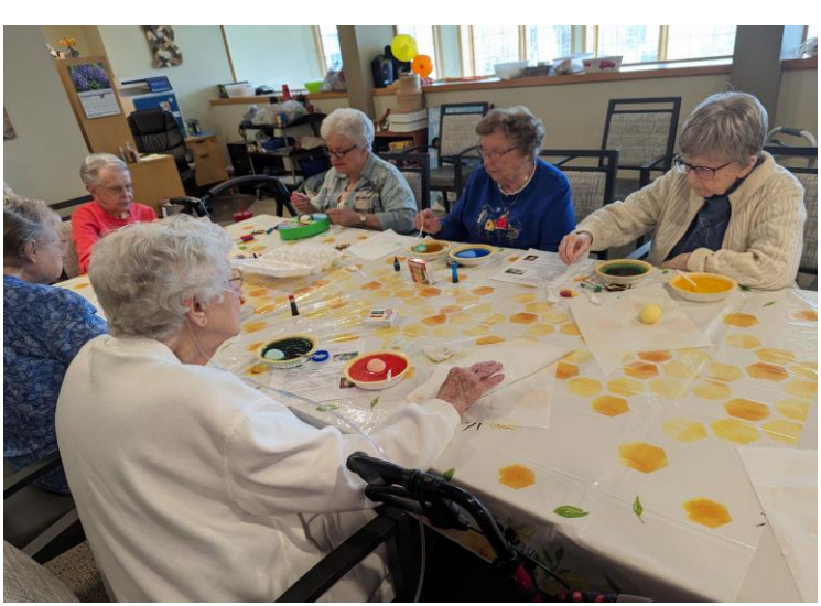
Going back in time is always a fun thing to do. Dying easter eggs and sharing stories of family easter's.