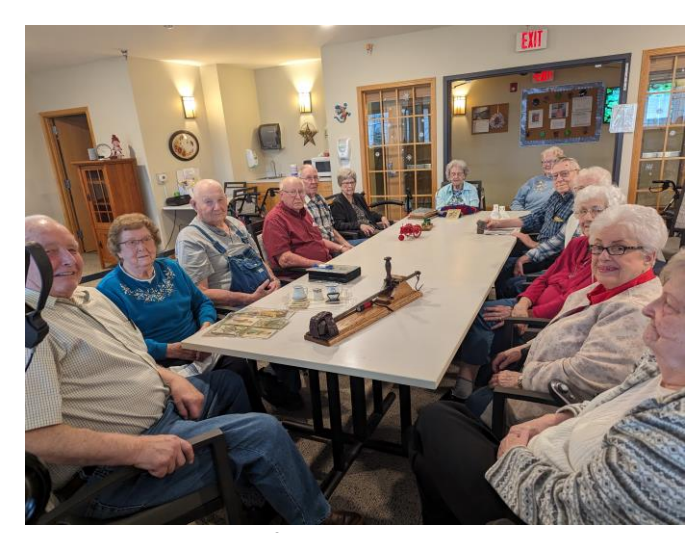
There was a lot of history and stories told.