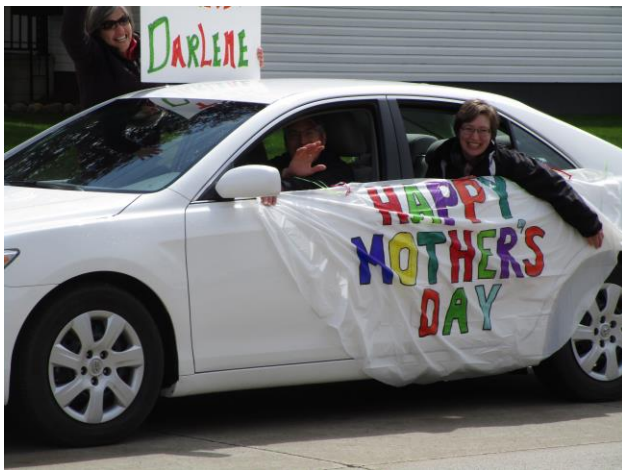
Team Darlene was really whooping it up at the parade.