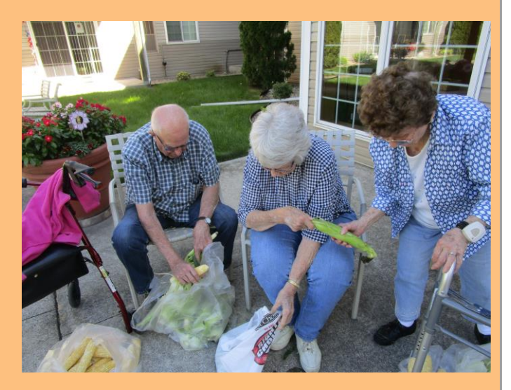
We couldn't believe how fast this group of residents could husk corn. They were either hungry for it or just wanted to get the job done. They did like 60 ears of corn in about 20 minutes. Good Job!