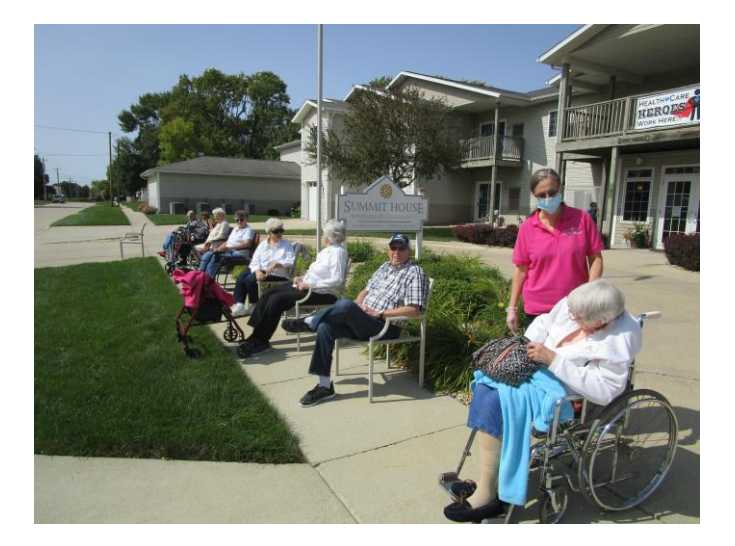
A big thank you to all who helped make our Grandparent's Day Parade a success. The residents had a good time being outside in the fresh air and watching the cars go by.