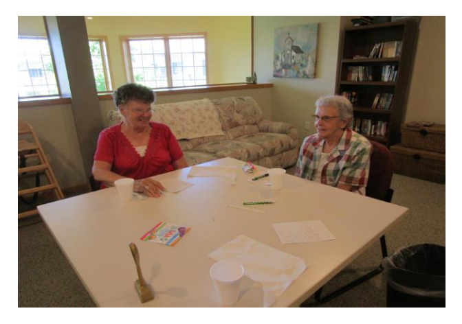
Judges are ready to taste the goodies.