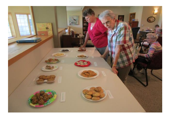
Looking over all the competition.