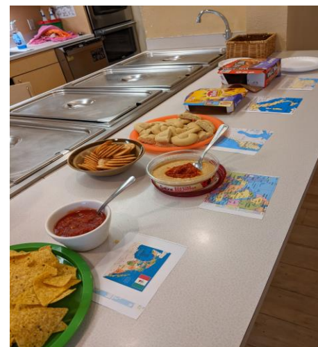
Residents enjoyed some food from other countries on World Food Day. We tried some hummus, kringla, egg rolls, salsa, and pizza bites.