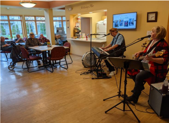
The Nords provided some great music to help us celebrate Veteran's Day.