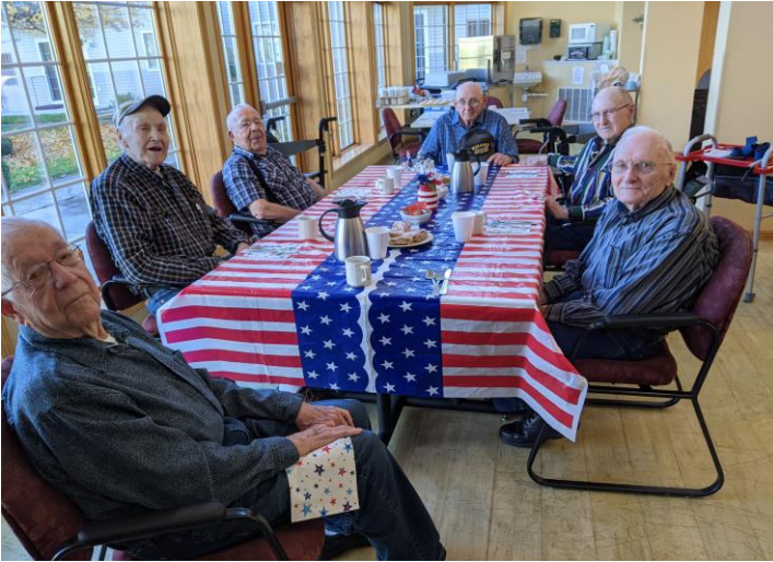
Our veterans were all gathered to enjoy a good homemade breakfast.