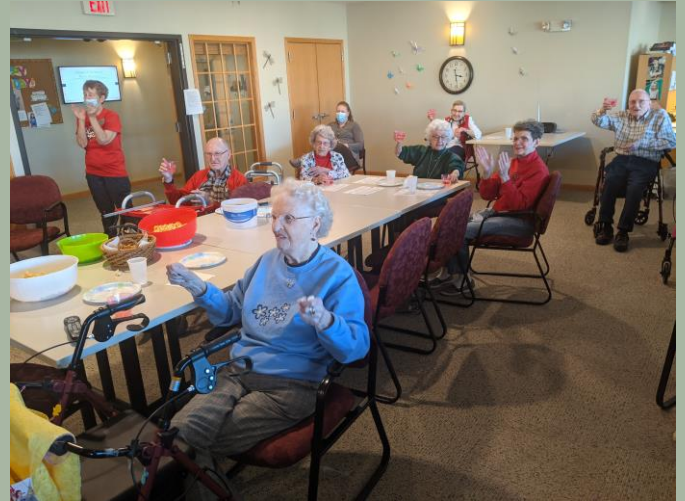
What an exciting afternoon it was for our residents. We had a great time watching the West Hancock Eagles win the high school football championship. We even popped the bubbly to celebrate the win.