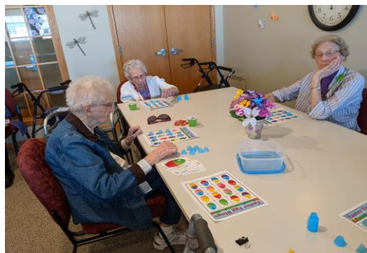
Colored Egg Bingo