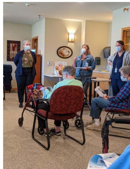
Senior Life Solutions had a presentation about the help residents can receive for any concerns they may have about their health.