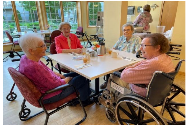
This group was enjoying some conversation while waiting to be served their breakfast.