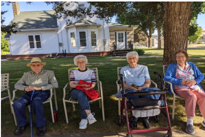
This bunch were excited to see a parade again.