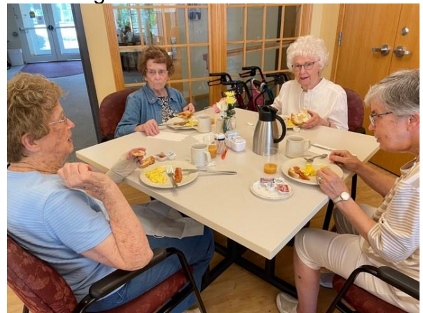
These ladies sure enjoyed the breakfast.