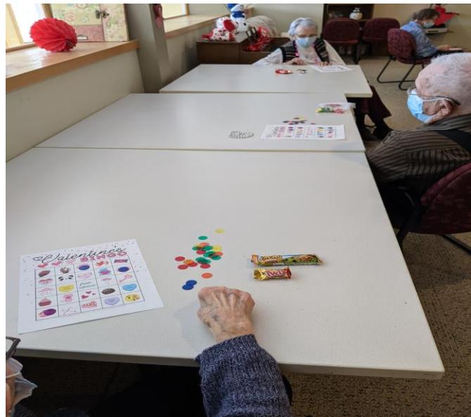
Valentine's Day Bingo for everyone.