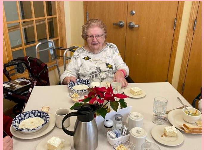
Um Um Good! Mickey was enjoying a hot bowl of Oyster stew prepared by the activity department. It really hit the spot on a cold day and warmed us up.