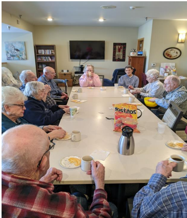
The residents enjoyed some chips and cheese, toasted bagels with cream cheese, and some Mozzarella cheese sticks.