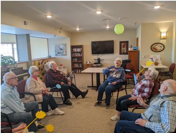
Laughter could be heard down the hallways with this activity.