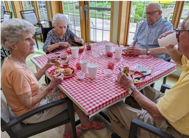
Residents enjoyed a great meal made on the grill.