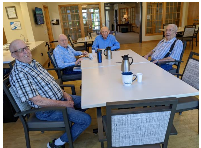
Father's Day was celebrated with a French toast and bacon breakfast and some Father's Day Bingo in the afternoon.