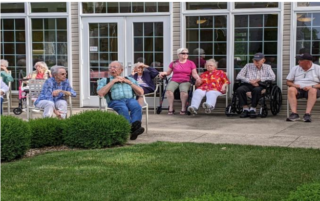
It was a beautiful night outside for some music.