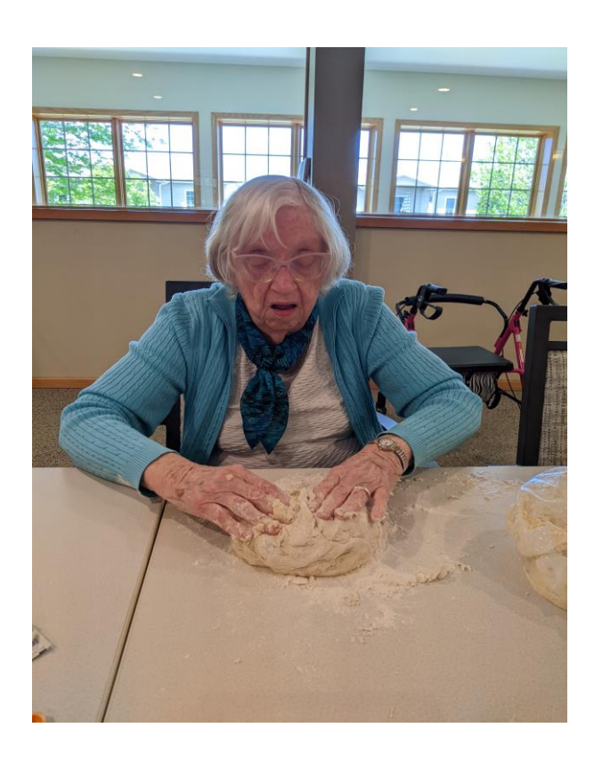
The good old days.