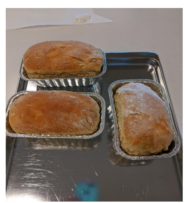
There's nothing better than fresh baked bread right out of the oven with a little butter.