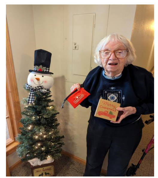
All the tenants received a goodie box and a first aid kit for Christmas.