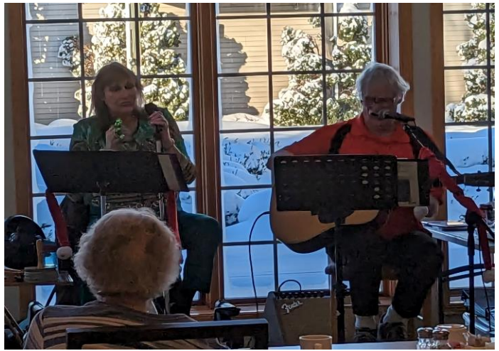
Island Fever was here to provide the tenants with some good old fashion Christmas music.

Everyone was a winner at our Holiday Bingo event.