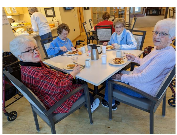
Good to the last bite!