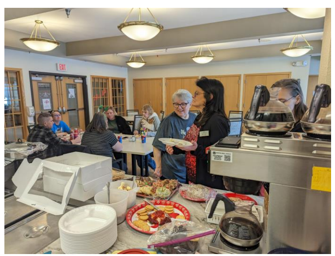
What a great way to celebrate the Christmas season. We each had a Secret Santa and plenty of food to go around.