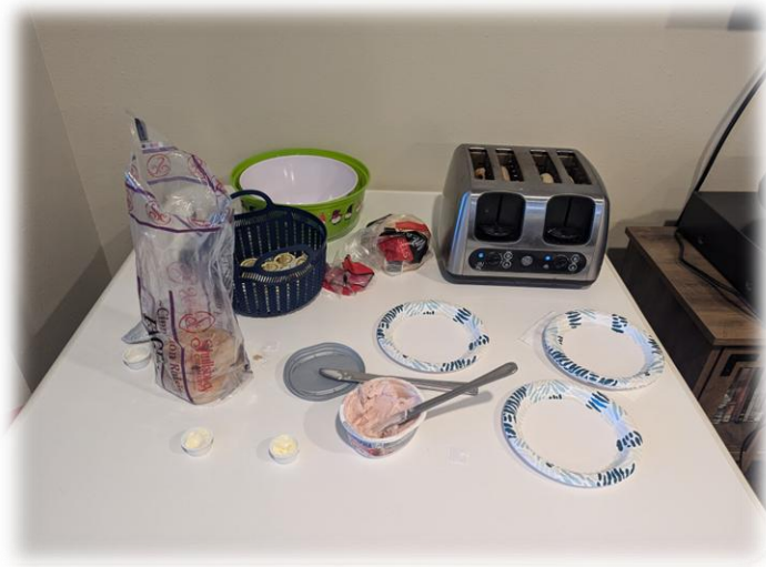
Our Bagel Station