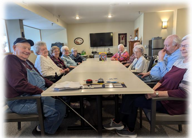
The residents just love this game. It definitely keeps your mind going.