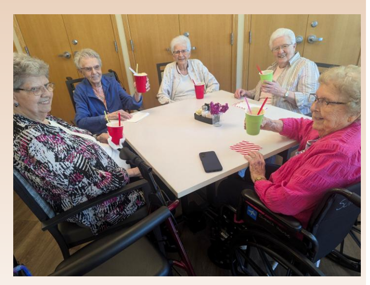
There is nothing better than a cold Root Beer float on a hot day.