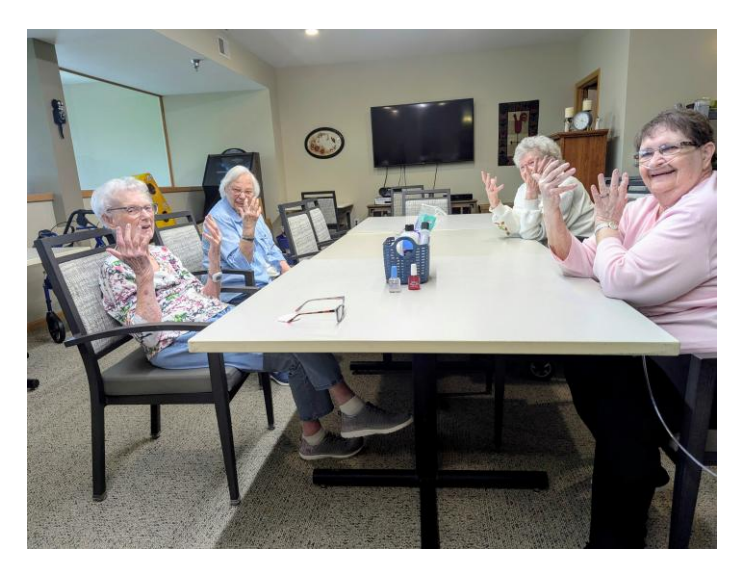
Nail day is a great way to socialize and have manicured nails that are beautiful.