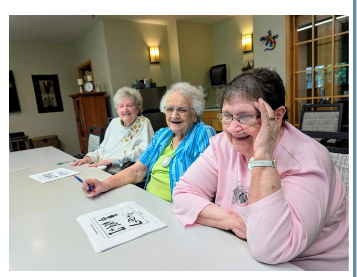
Brain games are always fun and somewhat challenging. It's a great way to get your brain going in overdrive.