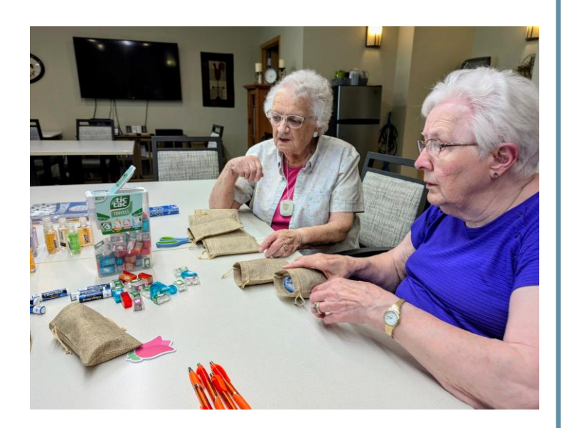
Making up some care packages for cancer patients at the Britt hospital.