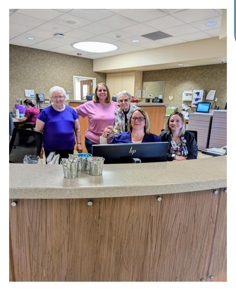
Thank you to all the nurses at the Britt hospital for all the loving care they provide.