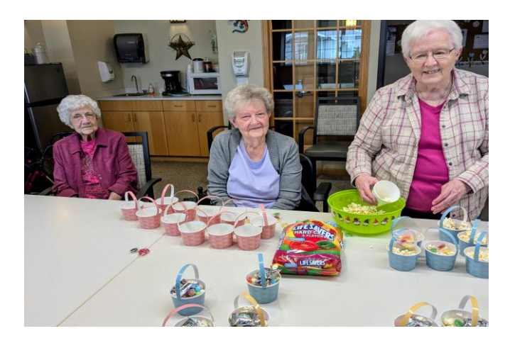
Making sure all the tenants get a May basket.