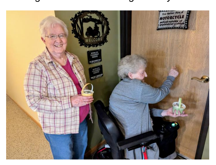
Run Girls Run!