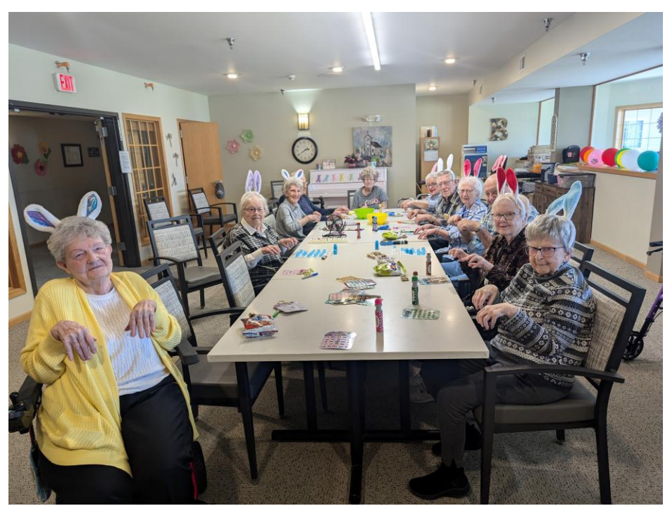
Bingo turned into a hopping good time for everyone!