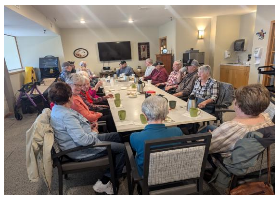
Join us for community coffee on Fridays at 9am. We have a great time when we all get together.