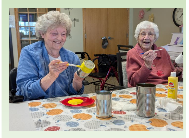
Thank you, ladies, for turning plain old cans into something we enjoy looking at.