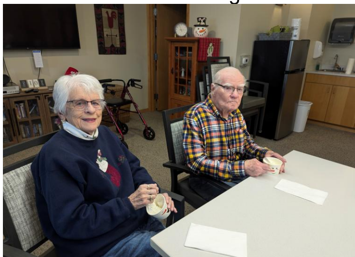
Snow Mint Ice Cream